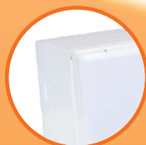
Metal Tray Provides Strength & Durability