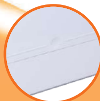
Effortless Push-to-open mechanism