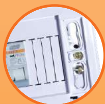
Adjustable Cover & DIN Rail for an Easy & Level Installation